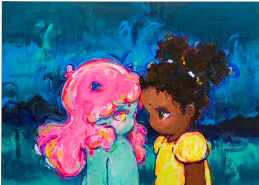
Okokume, Let's Play Outside , 2020, acrylic, soft and oil pastel on canvas, 89 x 125 cm.

JPS Art Gallery is pleased to present INSIDE, an exhibition of paintings by Okokume, on view at the gallery's Hong Kong location in LANDMARK ATRIUM. The exhibition marks the artist's third solo show with the gallery in Hong Kong. The presented works are to-date, the most intimate series created by the artist – exploring the inside of her mind and soul.