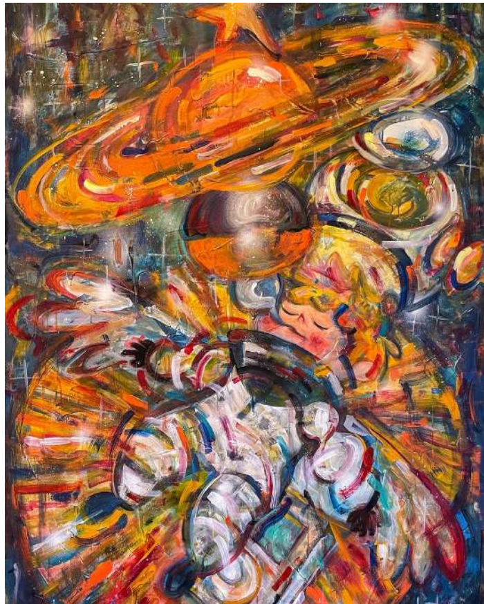
《分散》, 2022, acrylic on canvas, 200 by 110 cm.

Opening Reception: 20 May 2022, 4 - 8 pm