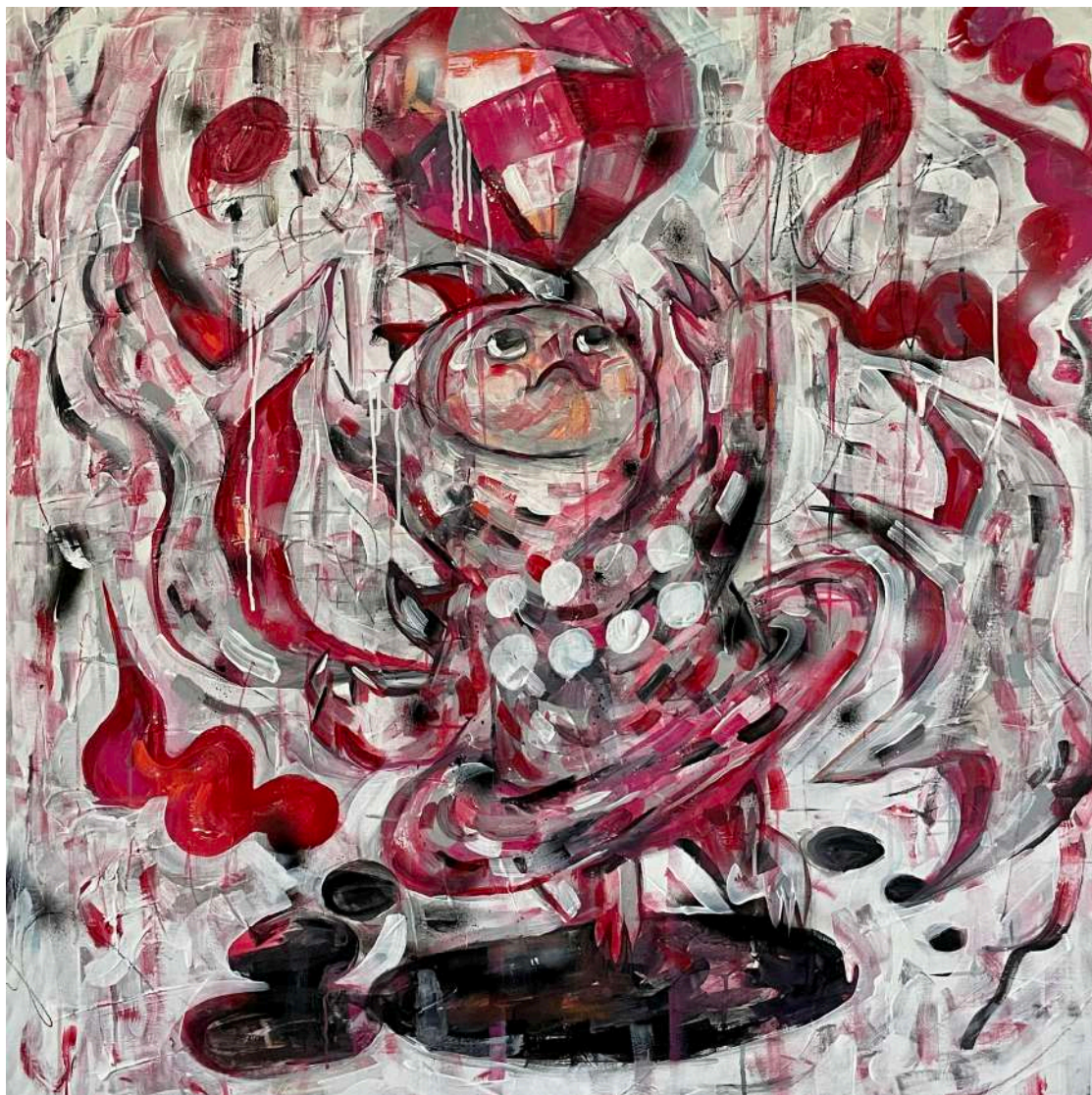
稜角 the true and unpolished me , 2022