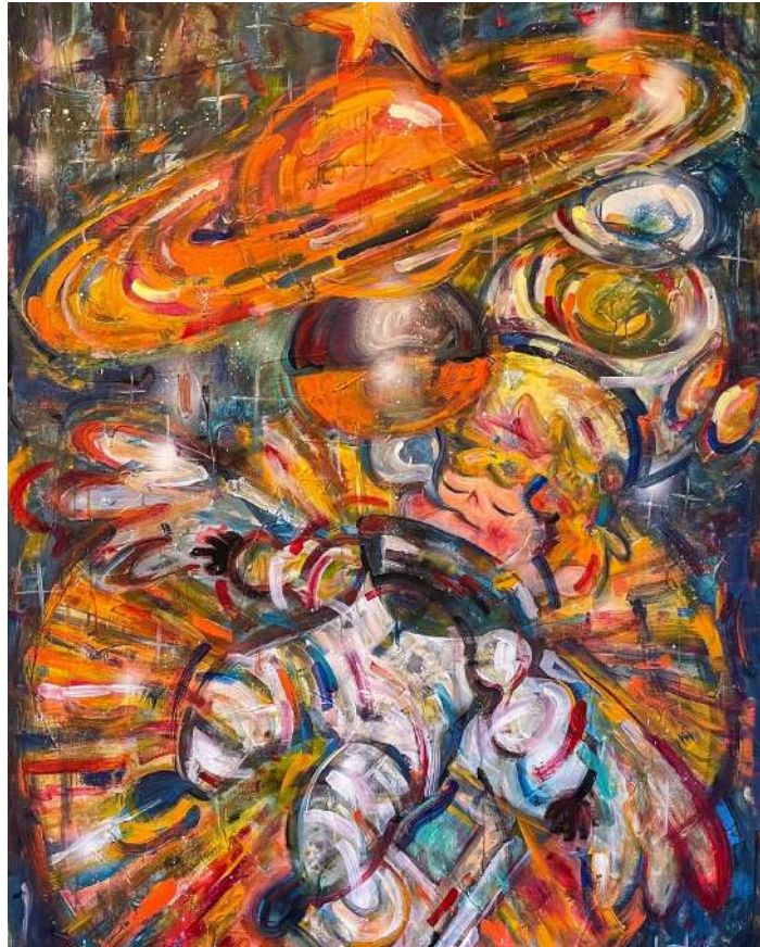
《分散》，2022年作，壓克力於畫布，200 x 110 釐米。