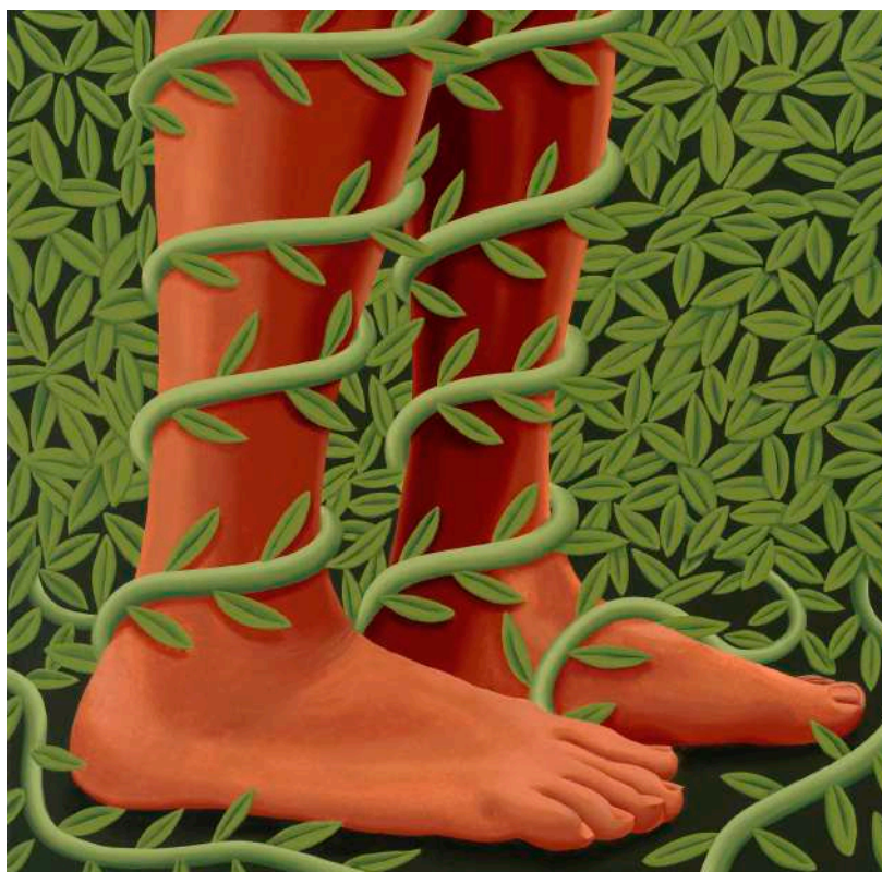
《Entwined》，2022，壓克力於畫布，55.8 x 55.8 厘米。