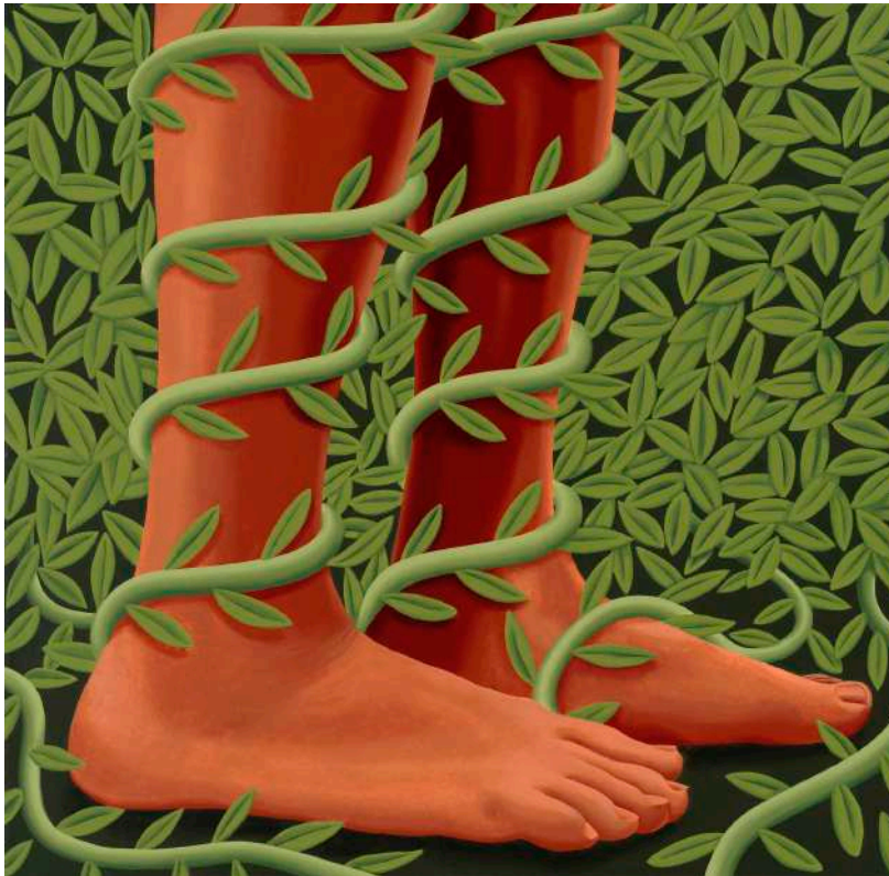
Entwined , 2022, acrylic on canvas, 55.8 by 55.8 cm.

Opening Reception: Thursday, 8 December 2022, 5 - 8 pm (Artist will be present)