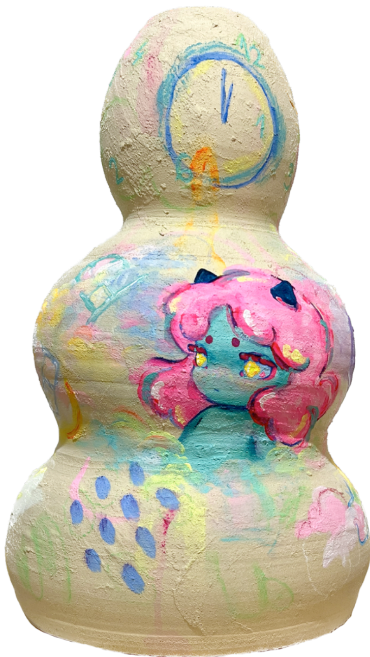
Vase 4, 2022

Acrylic and watercolour pencils on ceramic H55 by W35 by D35 cm