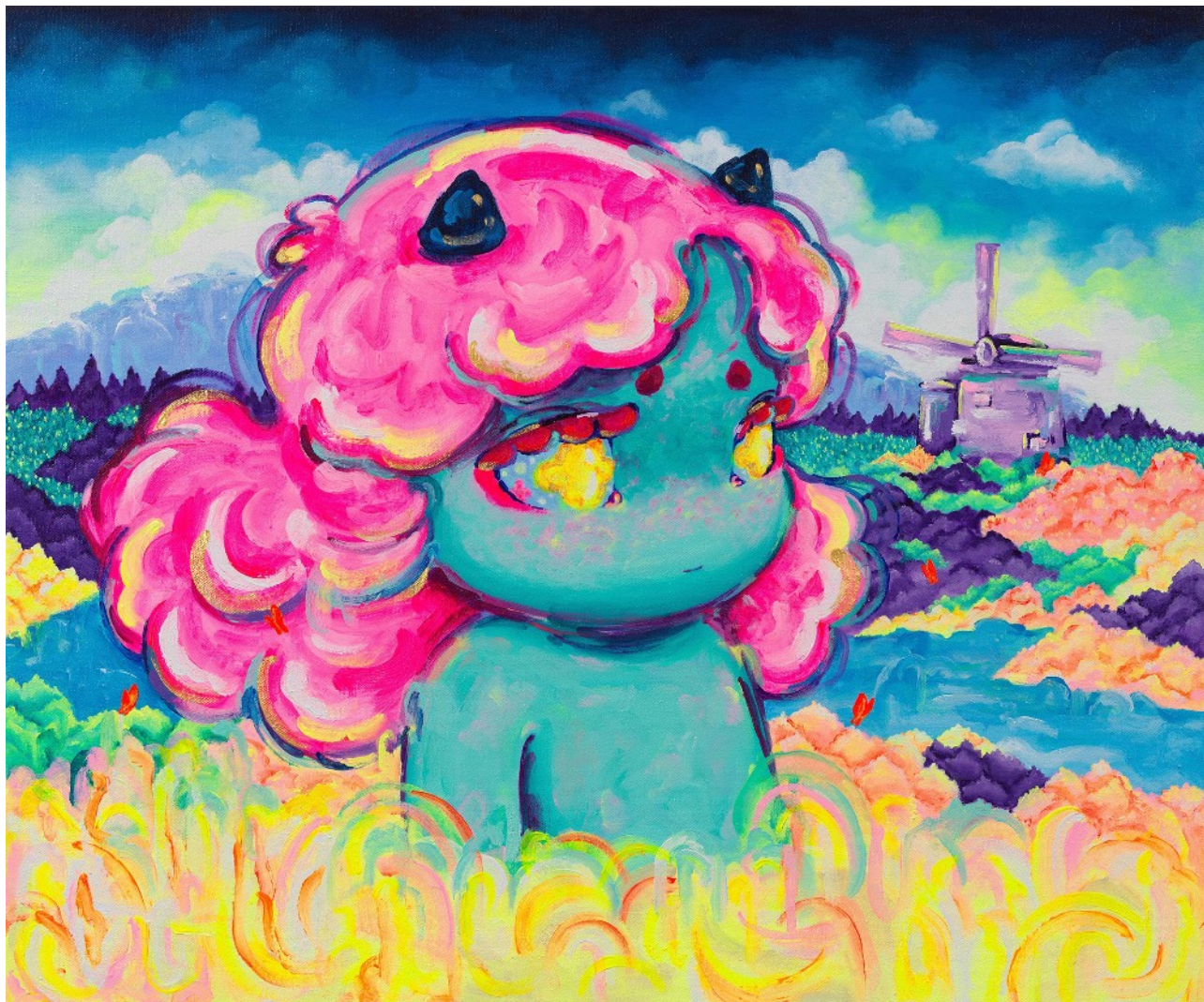
Frente al molino , 2022