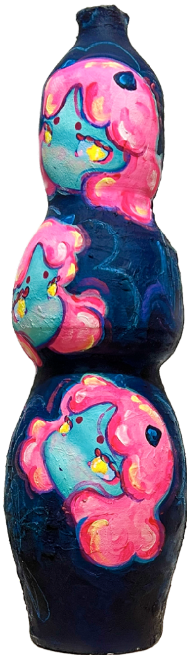
Vase 2, 2022

Acrylic and watercolour pencils on ceramic H75 by W25 by D25 cm