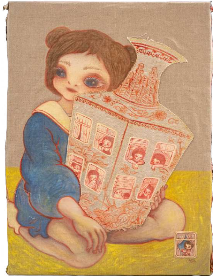
Together, we're alone , 2023, oil and canvas collage on linen, 84 by 60.5 cm.

Opening Reception: Wednesday, 19 April 2023, 6 - 9 pm (Artist will be present)