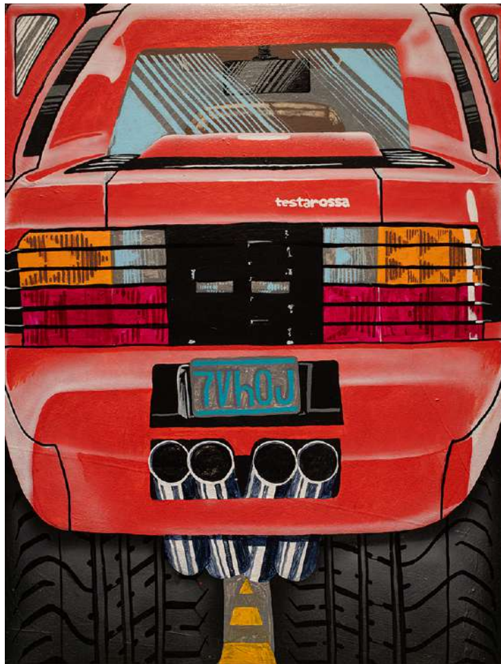
Testarossa , 2023, acrylic on canvas, 121.5 by 91.5 cm.

Opening Reception: Thursday, 28 September 2023, 5 - 8 pm (Artist will be present)