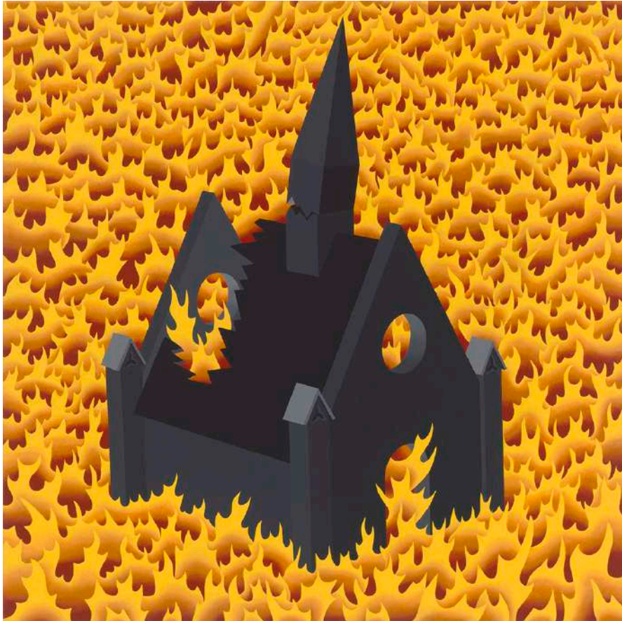
Inferno (#2) , 2023, acrylic on canvas, 55.88 by 55.88 cm.

Opening Reception: Wednesday, 11 October 2023, 6 - 9 pm (Artist will be present)