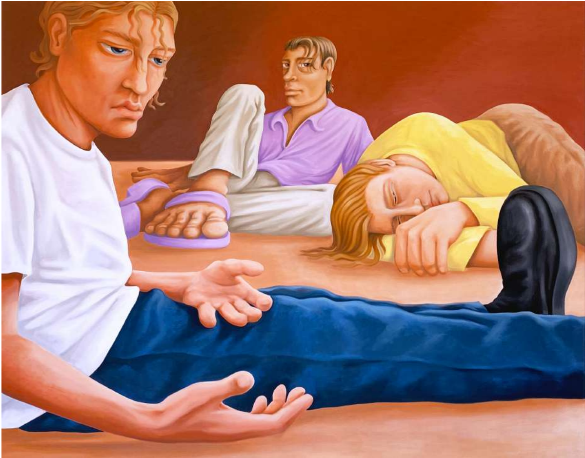
Untitled 3 , 2023, oil on canvas, 155 by 195 cm.

JPS Gallery is pleased to present Mellow doubt , British contemporary artist Joe Cheetham's first solo show in Asia, which will be exhibited at our Hong Kong gallery space. Cheetham is widely known across Europe for his exceptional ability to capture the collective jubilation of club culture through his unique depiction of cartoonish figures raving bodies in vibrant colours and eccentric gestural brushwork. However, his recent works reveal a noteworthy transition in Cheetham's artistic practice as he adopts a more subdued approach in addressing the physical tension and isolation that is emblematic of contemporary life.