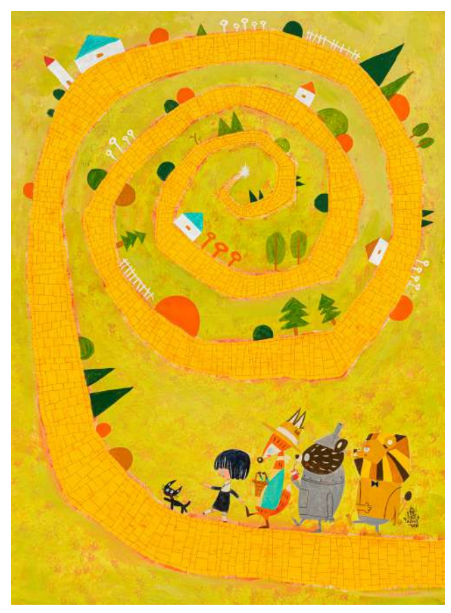
Guru Guru, 2023, acrylic on canvas, 150 by 110 cm.

"Toto, I've a feeling we're not in Kansas anymore." — The Wizard of Oz