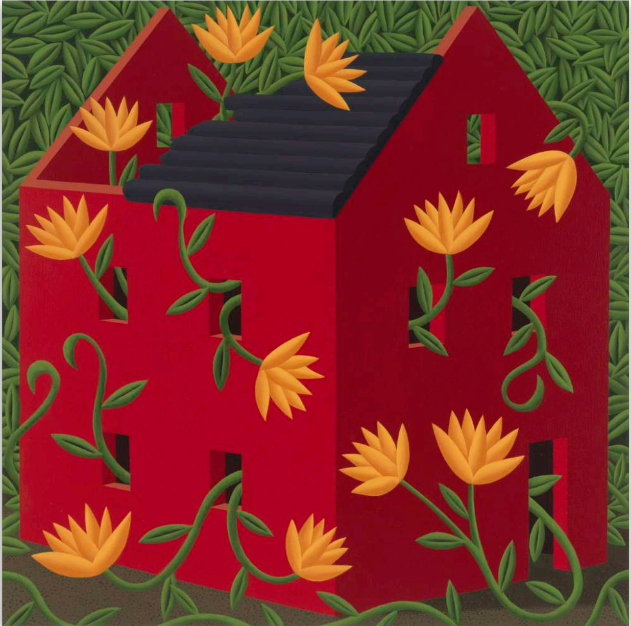
DAN OLIVER Red Ruin , 2023 Acrylic on canvas 60.96 by 60.96 cm