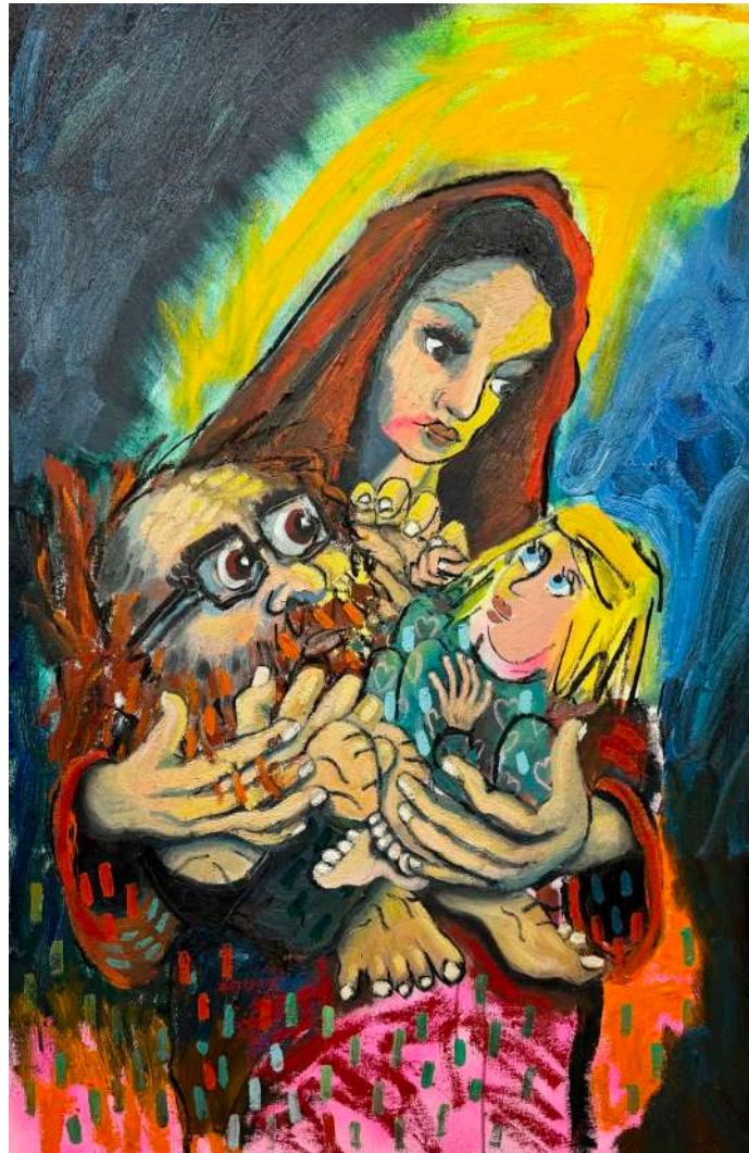
The Speagle's , 2024, acrylic, charcoal and oil on canvas, 116 by 76 cm.

Opening Reception: Thursday, 2 May, 2024, 5 - 8 pm