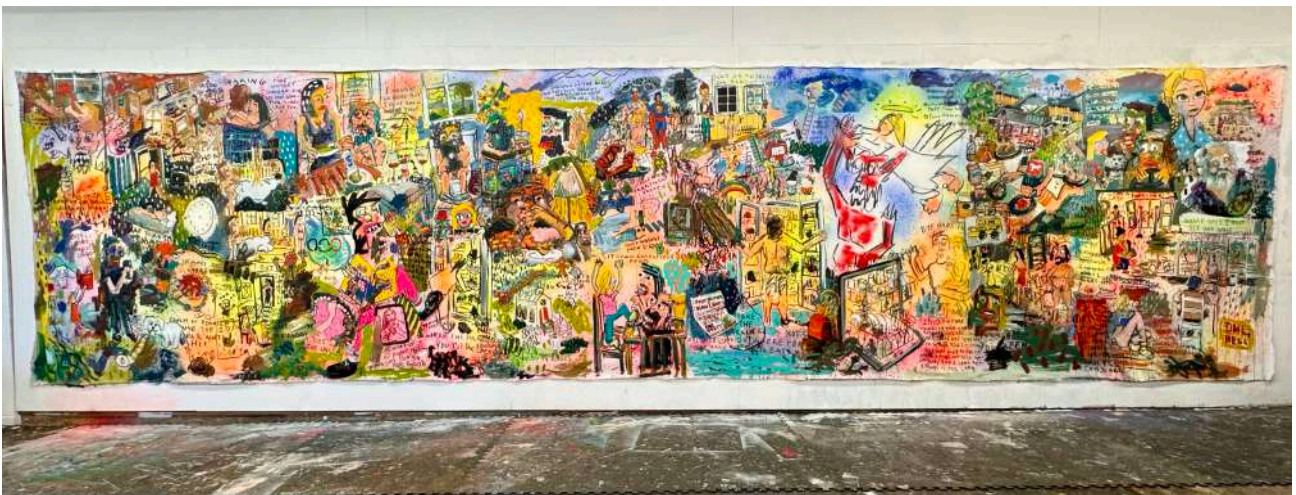
Let's make the most of this beautiful day. , 2024, acrylic, charcoal, graphite, oil and oil bar on canvas, 213.36 by 850.9 cm. Courtesy of the artist and JPS Gallery.