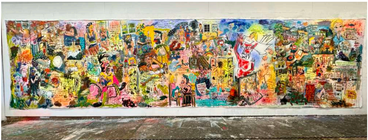
《Let's make the most of this beautiful day.》，2023-2024年作，壓克力、木炭、石墨、油畫顏料、油畫棒於畫布，213.36 x 850.9 cm。