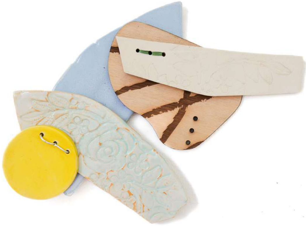
Ricko Leung, 《I don't see the big picture yet - I》, 2023-4年作。石器、珧瑯、木板、金屬線和絲帶, 24 by 32 by 3.8 厘米

Ricko Leung (1987年生於香港) 是一位常駐巴黎的綜合媒材藝術家和獨立策展人，她將展示一系列反映她面對逆境追求韌性和癒合的作品。此次展覽還將展示她受到生態女性主義研究啟發的新系列作品，巧妙地結合了自然和女性元素。這些作品的創作過程完全由本能驅動，沒有預設的最終結果，創作出擁抱隨機性並探討個體性和集體性的主題作品，比喻性地將日常消費選擇與其對生態系統的影響聯繫起來。