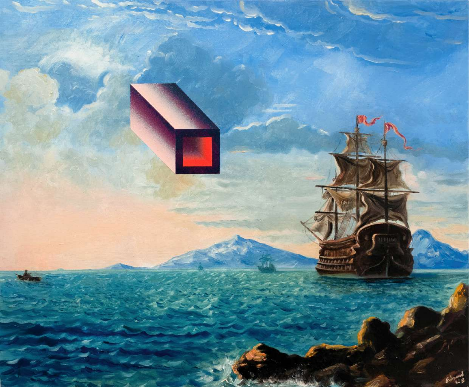
Edmond Li Bellefroid, Nouveau Monde , 2024. Oil and acrylic on canvas, 38 by 46 cm

Edmond Li Bellefroid's (b.1987, Paris, France) romanticised paintings of nineteenth-century picturesque landscapes will continue to feature floating geometric shapes seemingly overlooking the scene from the sky. Its otherworldly form and bold colours invites viewers to question their relationship with the natural scenery. Are they witnessing the union of two realities or the invasion of one another? This intriguing juxtaposition is sure to leave a lasting impression.