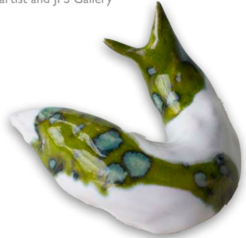
Lokz Phoenix, Limace_F0406_8 , 2023. Ceramic, 8 by 4.2 cm

Lokz Phoenix (b.1986, Hong Kong) is a painter and ceramicist based in Paris. Her exhibited works will feature enchanting portrayals of the lush vegetation she encountered during her explorations in France and Asia. Through her masterful brushwork, Lokz infuses this often-overlooked greenery with an eerie and magical allure, beckoning viewers to immerse themselves in her whimsical forest realm. To further enhance her art's enchanting ambience, Lokz will adorn the exhibition walls with an added touch of wonder by incorporating ceramic slugs that seem to have crawled out of her paintings.