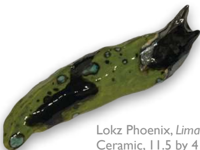
Lokz Phoenix, Limace_F1202 , 2024. Ceramic, 11.5 by 4 cm

Lokz Phoenix (b.1986, Hong Kong) is a painter and ceramicist based in Paris. Her exhibited works will feature enchanting portrayals of the lush vegetation she encountered during her explorations in France and Asia. Through her masterful brushwork, Lokz infuses this often-overlooked greenery with an eerie and magical allure, beckoning viewers to immerse themselves in her whimsical forest realm. To further enhance her art's enchanting ambience, Lokz will adorn the exhibition walls with an added touch of wonder by incorporating ceramic slugs that seem to have crawled out of her paintings.