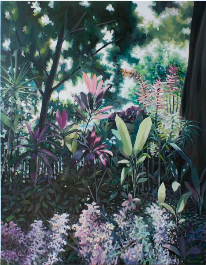
Lokz Phoenix, 《Stroll with parents》, 2024年作。油畫和壓克力於畫布, 146 by 114 厘米