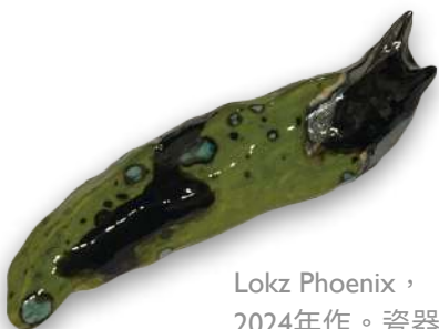
Lokz Phoenix, 《Limace_F1202》, 2024年作。瓷器, 11.5 by 4 厘米

Lokz Phoenix (1986年生於香港) 是一位常駐巴黎的畫家和陶藝家。她的作品將呈現她在法國和亞洲的旅途中所見的茂盛植被。透過她嫺熟的筆觸, Lokz賦予這些常被忽視的綠色植物一種詭異而魔幻的魅力, 吸引觀眾沉浸在她的奇幻森林世界中。為了進一步烘托森林的氣氛, 展牆將會裝飾藝術家製作的陶瓷蛞蝓, 它們彷彿從她的畫作中爬出來, 為展覽增添了一絲大自然的魔力。