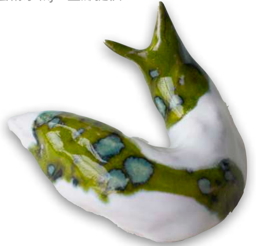
Lokz Phoenix, 《Limace_F0406_8》, 2023年作。瓷器, 8 by 4.2 厘米

Lokz Phoenix (1986年生於香港) 是一位常駐巴黎的畫家和陶藝家。她的作品將呈現她在法國和亞洲的旅途中所見的茂盛植被。透過她嫺熟的筆觸, Lokz賦予這些常被忽視的綠色植物一種詭異而魔幻的魅力, 吸引觀眾沉浸在她的奇幻森林世界中。為了進一步烘托森林的氣氛, 展牆將會裝飾藝術家製作的陶瓷蛞蝓, 它們彷彿從她的畫作中爬出來, 為展覽增添了一絲大自然的魔力。