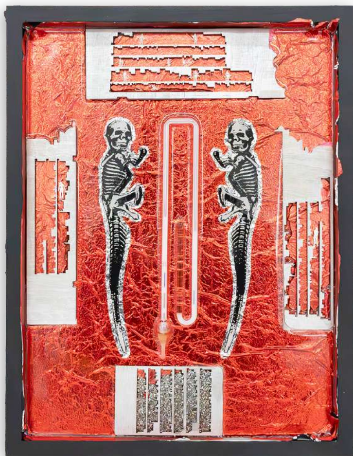
Joe Foti, 《24-5 Flight Dream》(左), 2024, 混合媒體, 41.5 x 29.7 x 3.4 厘米。 《24-1 Neal And Jack And Me》(右), 2024, 混合媒體, 41 x 32 x 2 厘米 © 圖片由藝術家和JPS畫廊提供。