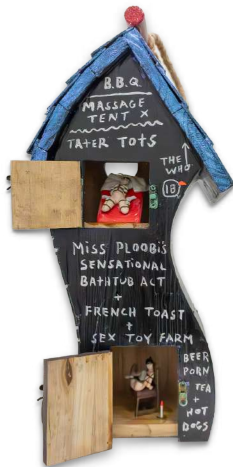
Joe Foti，《B20 The Bitch & The Whore (Birdhouse Series)》，2024，混合媒體，41.5 x 19.5 x 16 厘米

二十多座用心打造的鳥屋將會以不同高度懸掛在畫廊的一角。這個微型奇觀以破舊的鄉間小屋為創作靈感。小屋在白天是燒烤場所，晚上則變身為地下酒吧和艷舞俱樂部，反映1960至1970年代美國的某處角落。它們敘述著「禁酒縣」一些秘密場所的故事。在那裡，禁酒令盛行，外人很少涉足。Foti的作品既保留這些被遺忘的原始活力，也體現隱藏在這些場所的神秘魅力，讓觀眾以奇幻的方式一睹昔日的時光。而且，當你仰望這個充滿懷舊藝術氣息的漂浮街角時，輕微的暈眩就仿如一種回到過去的感覺。