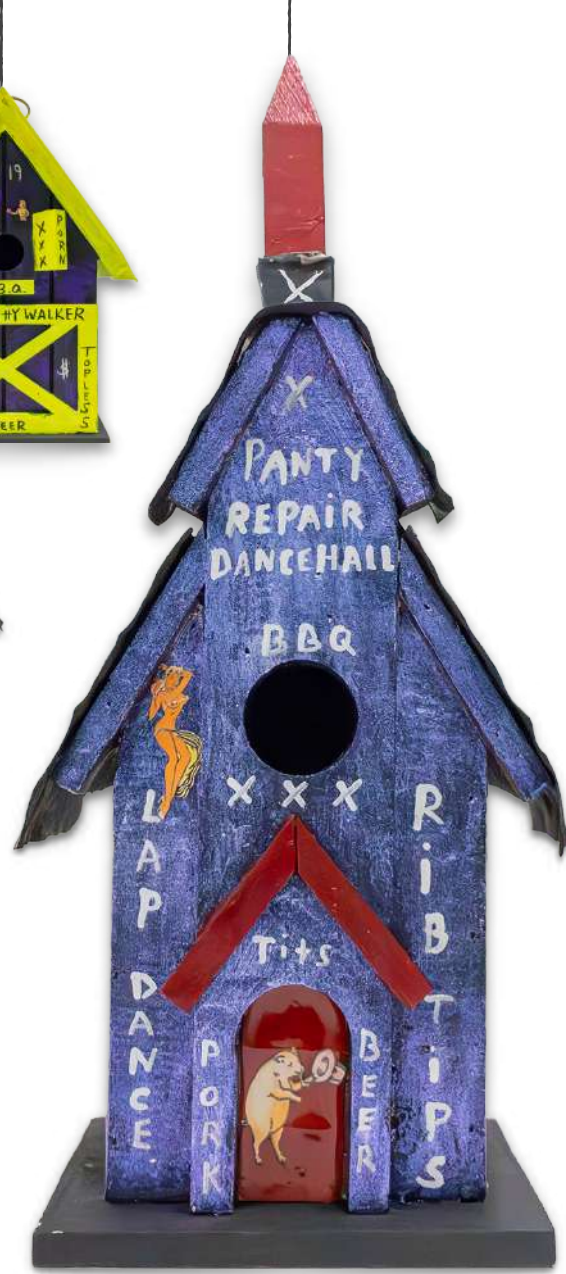
Joe Foti, Birdhouse Series , 2024, mixed media, dimensions variable.