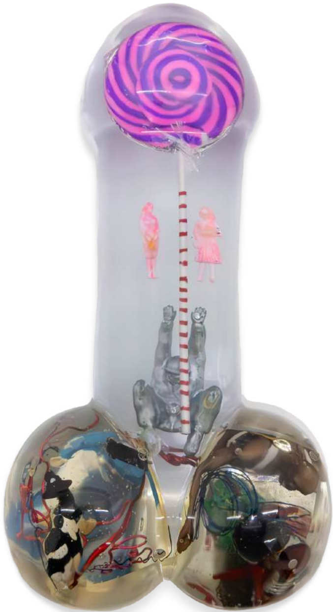
Joe Foti, 《Wonka (Penis Paper Weight Series)》, 2024, 混合媒體, 26.5 x 13.5 x 7.5 厘米

紙鎮系列是Foti的大膽創作之一，這些作品的形狀就像它們的名字一樣。它們既是大膽的宣言，也是複雜的藝術容器。盛載著Foti的精湛工藝，展現出他的非凡創造力。且看這個紙鎮系列會為你帶來脫俗不凡的美感，還是讓你會心微笑的驚喜！