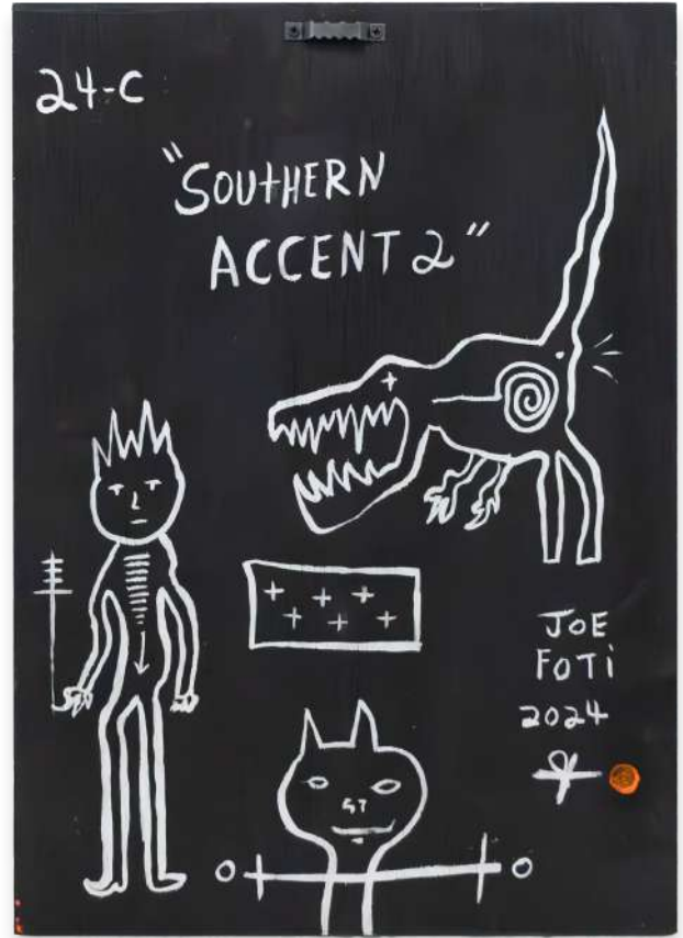
Joe Foti, 《24-C Southern Accent 2 (A - Z Series)》, 2024, 混合媒體, 42 x 30 x 4.5 厘米