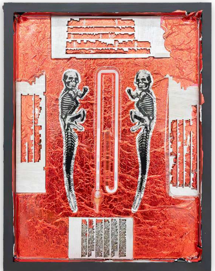
Joe Foti, 24-5 Flight Dream (Left) and 24-1 Neal And Jack And Me (Right), 2024, mixed media, H41.5 by W29.7 by D3.4 cm (Left) and H41 by W32 by D2 cm (Right). © Courtesy of the artist and JPS Gallery