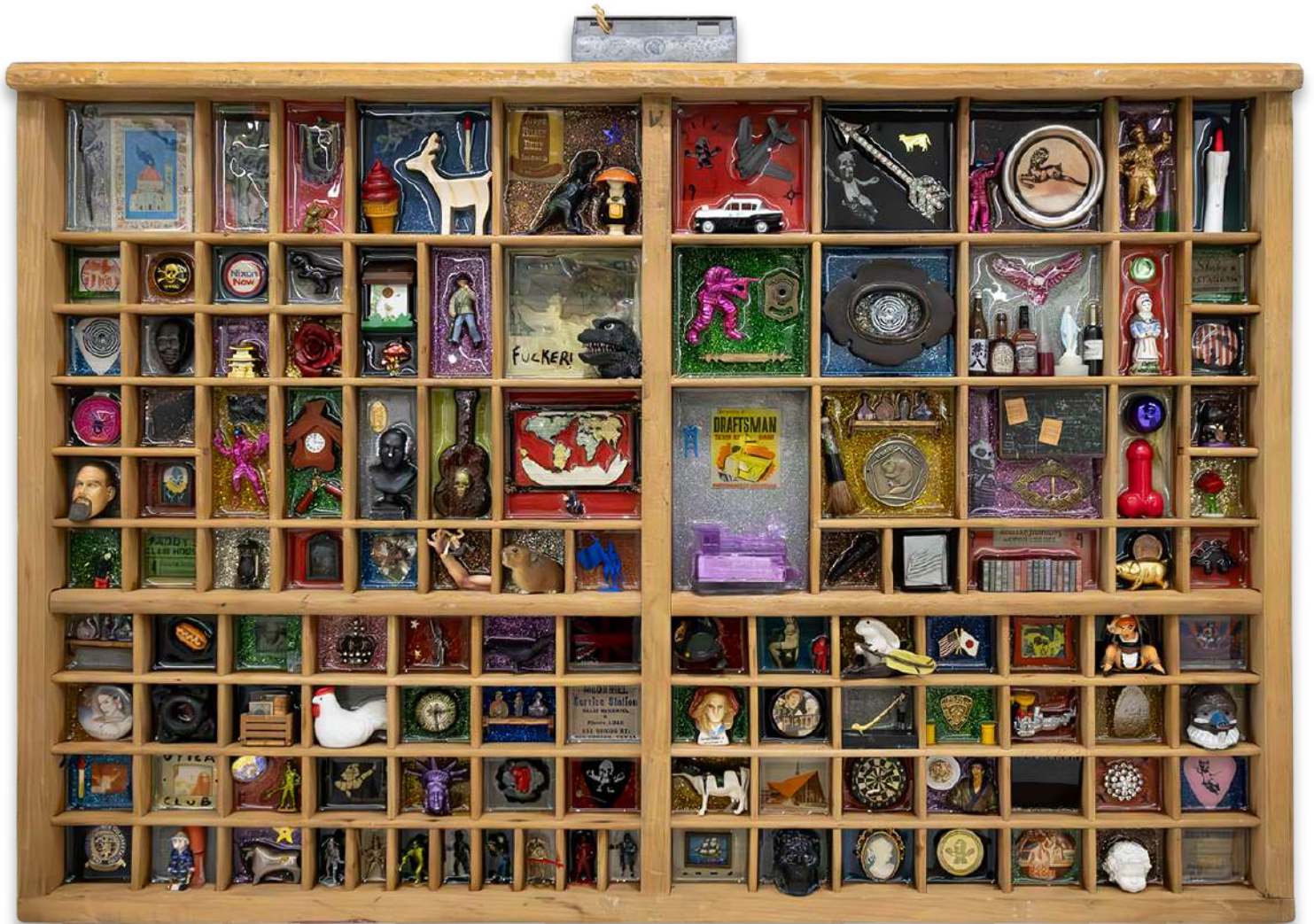
Joe Foti, R-5 Power Windows (R Series) , 2024, mixed media, H44 by W65 by D4.5 cm. © Courtesy of the artist and JPS Gallery