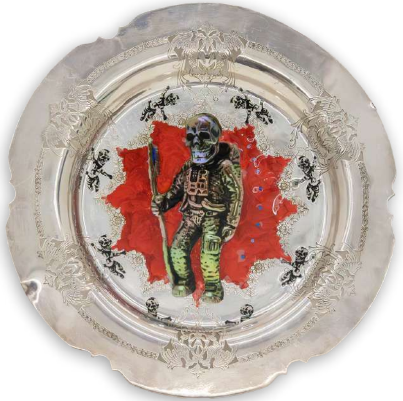
Joe Foti, T-15 Philomon (Silver Trays Series), 2024, mixed media, H25 by W25 by D1.5 cm.