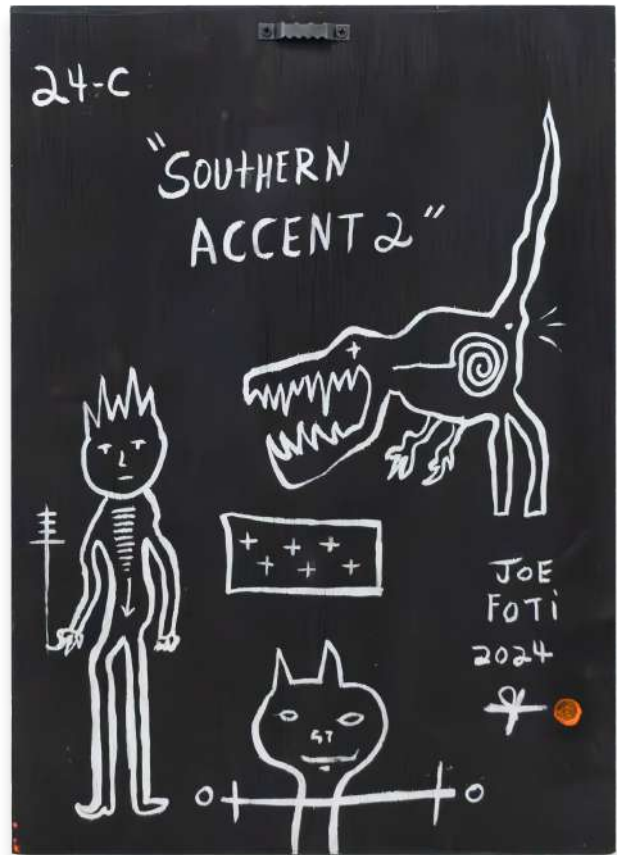
Joe Foti, 24-C Southern Accent 2 (A - Z Series) , 2024, mixed media, H42 by W30 by D4.5 cm.