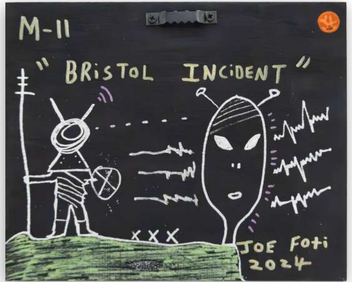
Joe Foti, M-11 Bristol Incident (M Series), 2024, mixed media, H18 by W21.5 by D5 cm.