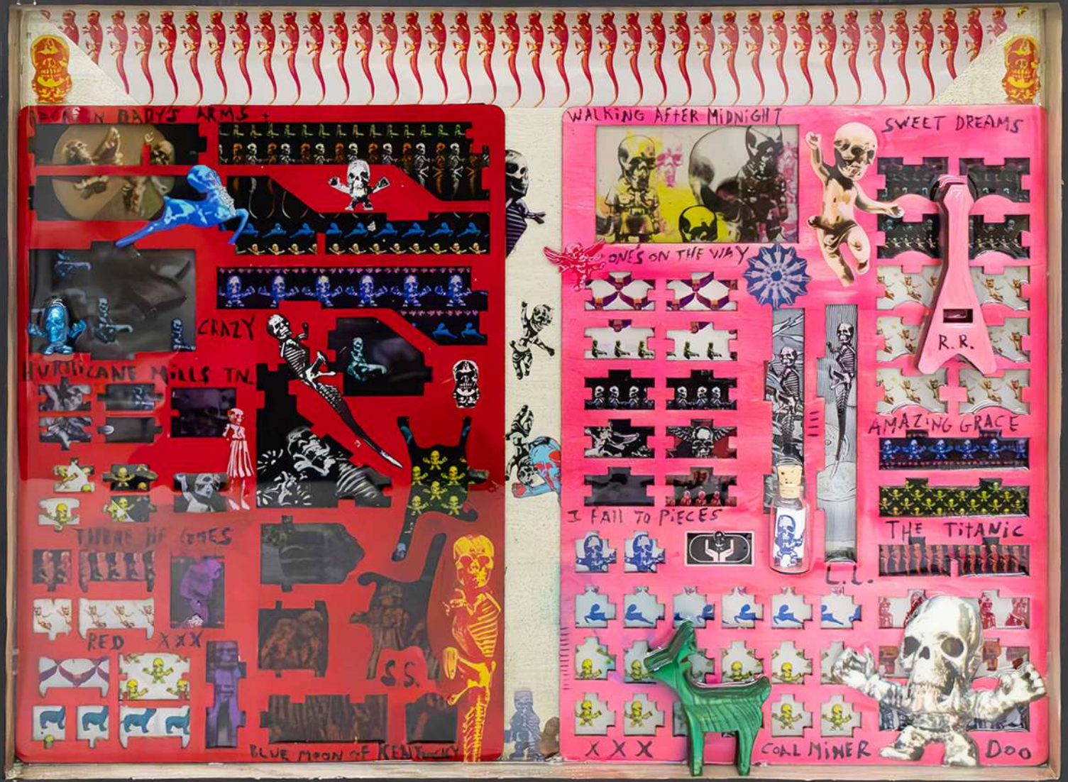
Joe Foti, 24-14 Loretta's Movie (24 Series), 2024, mixed media, H32 by W41 by D2.5 cm.