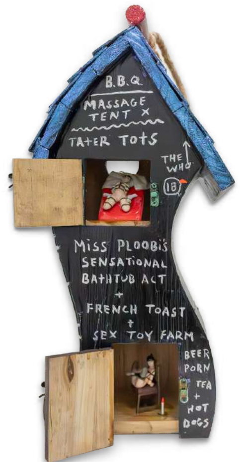
Joe Foti, B20 The Bitch & The Whore (Birdhouse Series), 2024, mixed media, H41.5 by W19.5 by D16 cm.

Gallery visitors will be greeted by a constellation of over 20 meticulously crafted birdhouses, each suspended from the ceiling at varying heights. Inspired by rundown countryside shacks that served barbecue by day and transformed into underground booze-and-burlesque clubs by night, these miniature marvels capture a slice of 1960s and '70s Americana. They tell the story of secretive venues in "dry counties," where prohibition reigned, and outsiders rarely ventured. Foti's creations preserve the raw energy and clandestine charm of these forgotten spaces, offering a unique glimpse into a bygone era—all while giving visitors a slight case of vertigo as they gaze upward at this floating neighbourhood of artistic nostalgia.