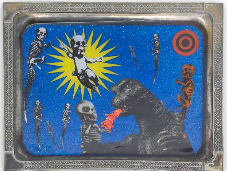
Joe Foti，《T-9 Momoko (Silver Trays Series)》，2024，混合媒體， 25.5 x 32 x 2 厘米

展覽將透過幾個引人入勝的系列展開，每個系列都象徵Foti的獨特風格和大膽的幽默感。在進入展覽之前，先介紹一下Foti創作的骷髏頭角色人物，每個角色都擁有複雜的背景、個人怪癖和莫名其妙的超能力。在這十二個角色中，有發明熱狗樹的傲慢農夫Buford、能背誦圓周率小數點後12234位的烹飪神童Harris Teeter，以及在是次展覽中，會以高達兩尺的雕塑造型出現，令你一見難忘的情場騙子桌球手Skippy。