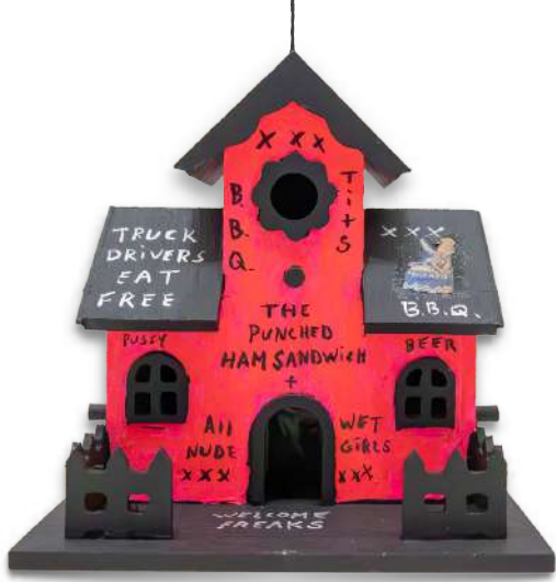
Joe Foti, 《Birdhouse Series》, 2024, 混合媒體, 尺寸各異