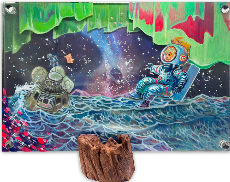
JACKIE LAM a.k.a. 009, Dimension Ocean , 2025, acrylic on acrylic sheet, H46 by W60 by D13.5 cm