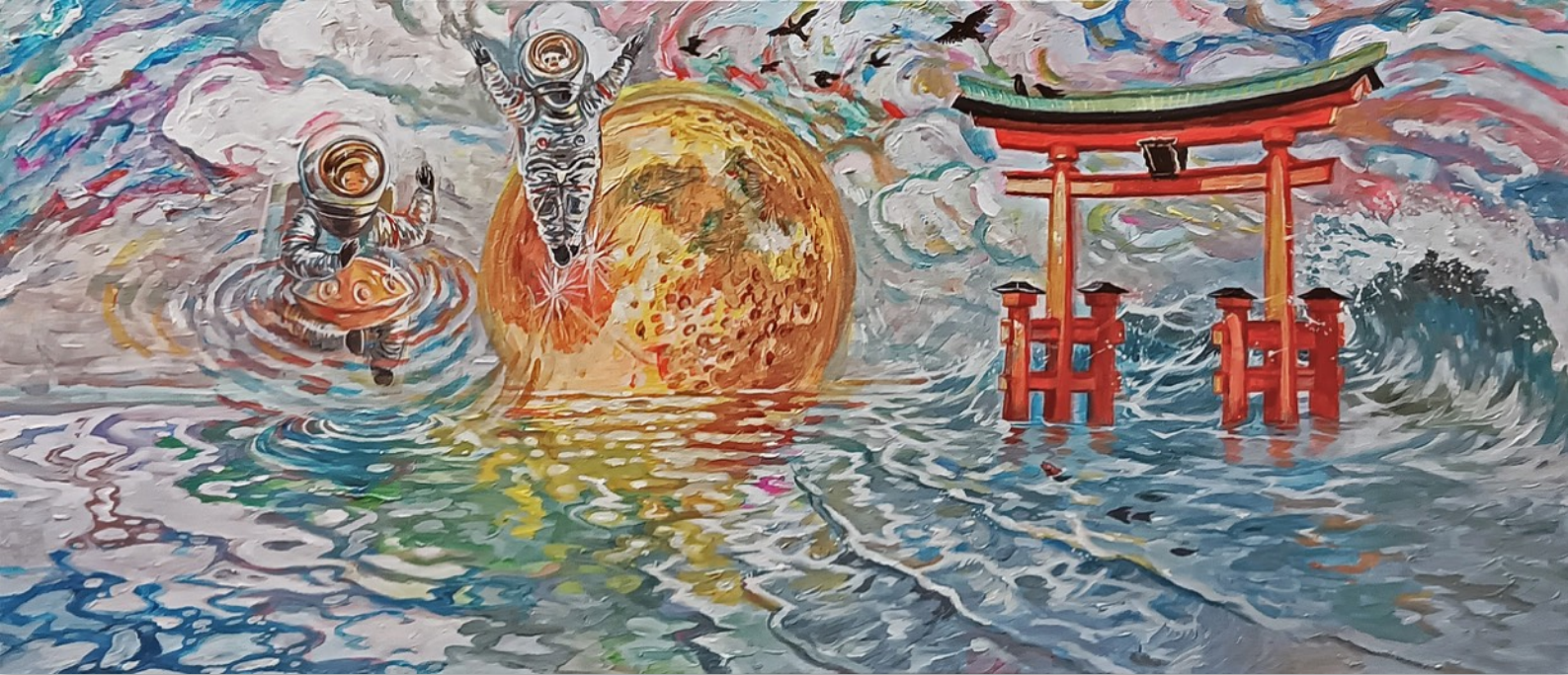
JACKIE LAM a.k.a. 009, 共振 Resonance, 2025, acrylic on canvas, 43 by 100 cm