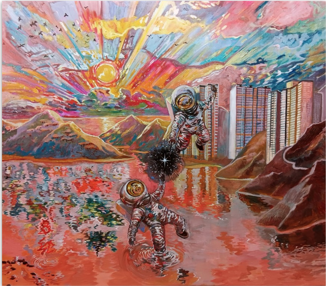
JACKIE LAM a.k.a. 009, 《在時空的鏡頭，我們終於相遇 In the lens of time and space, we finally meet》, 2025。壓克力於畫布，83 x 94 厘米