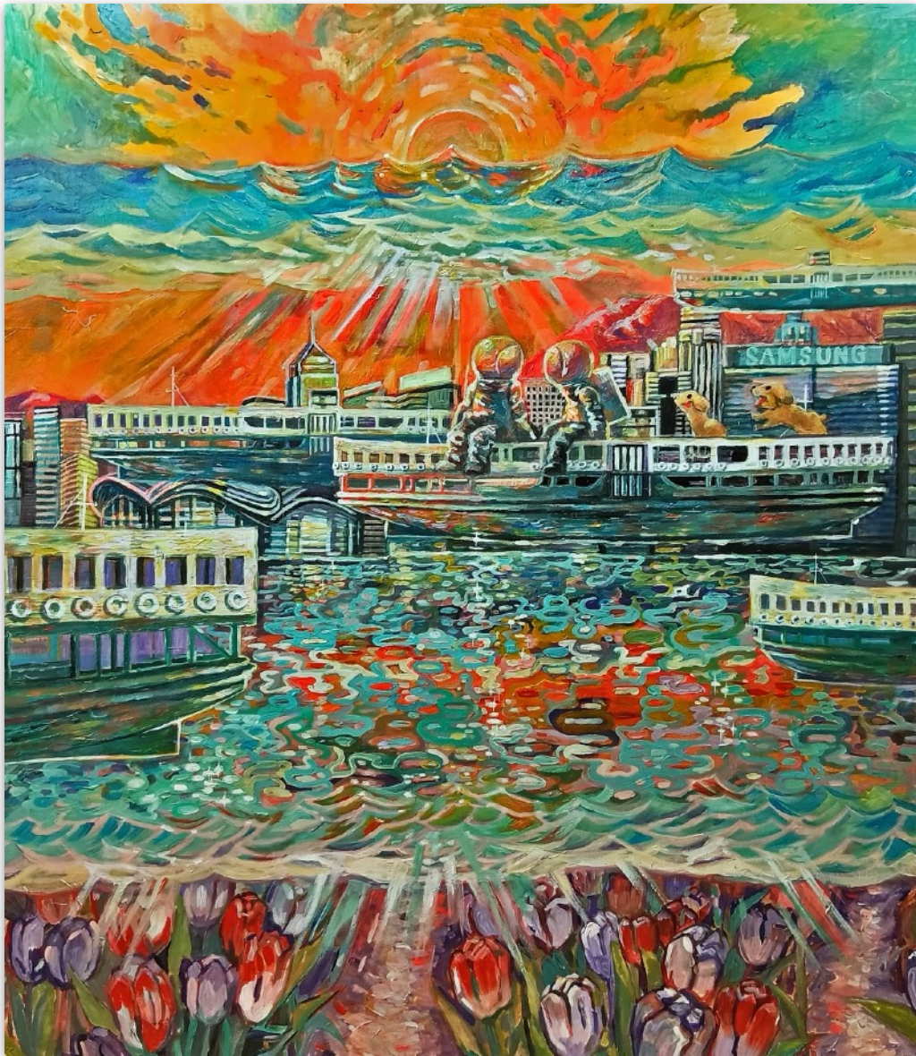
JACKIE LAM a.k.a. 009, From fantasy to reality , 2025, acrylic on canvas, 99 by 86 cm