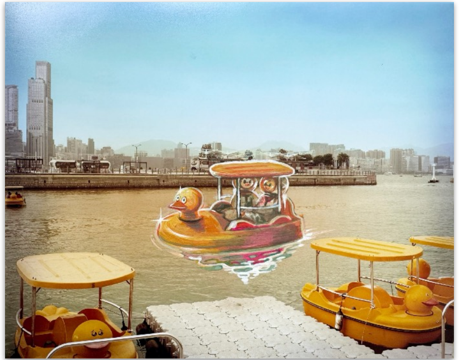
JACKIE LAM a.k.a. 009, Untitled 1 , 2025, acrylic on photo, 20.3 by 25.4 cm