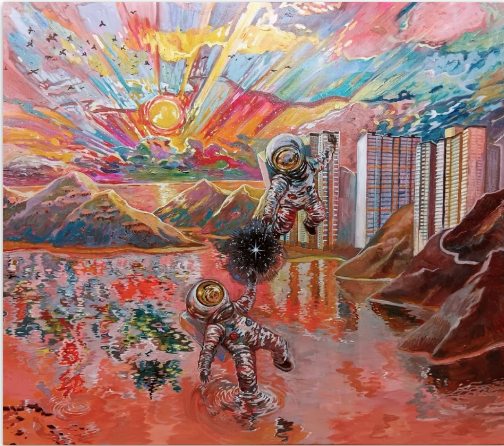
JACKIE LAM a.k.a. 009, 在時空的鏡頭，我們終於相遇 In the lens of time and space, we finally meet , 2025, acrylic on canvas, 83 by 94 cm