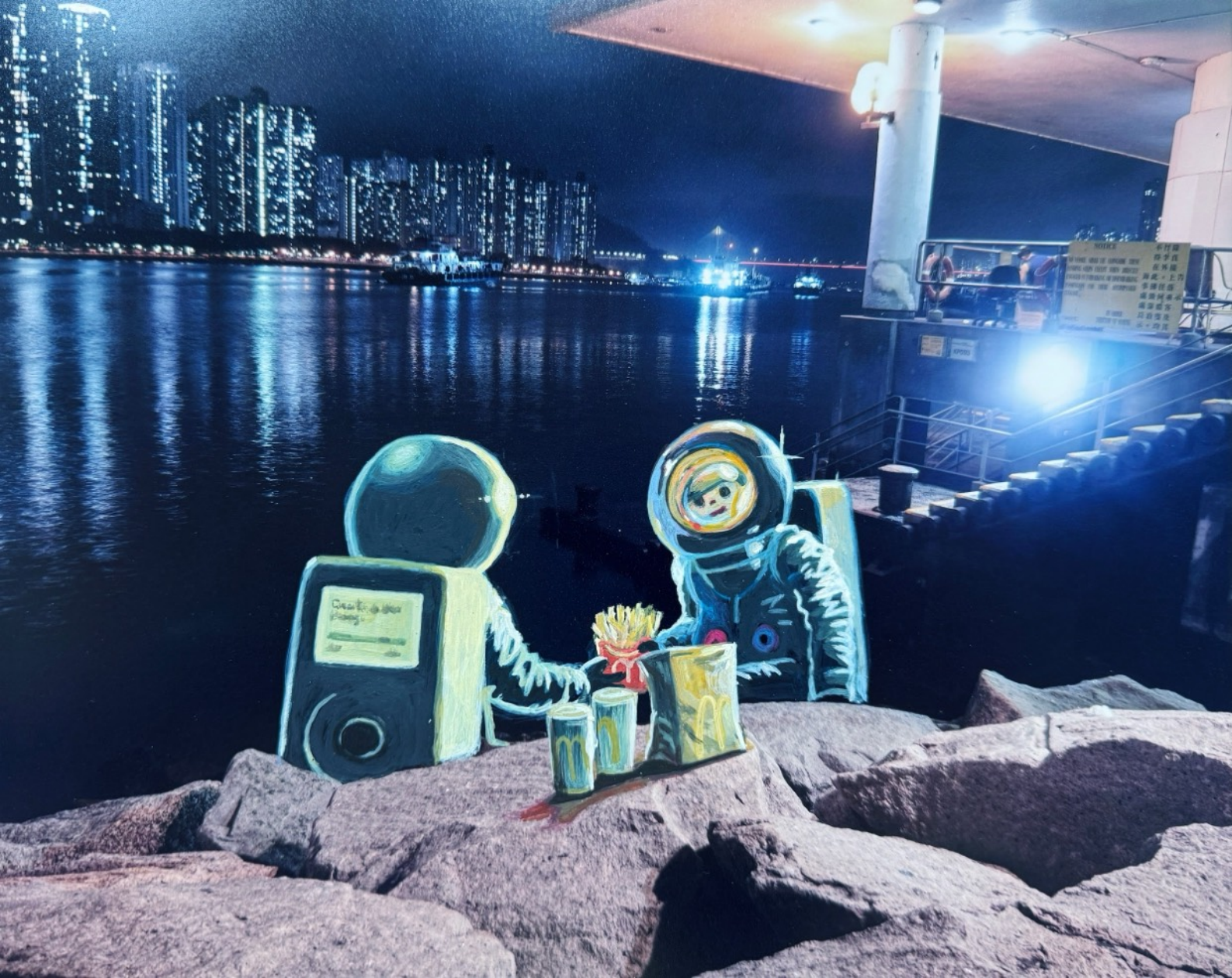
JACKIE LAM a.k.a. 009, Untitled 4 , 2025, acrylic on photo, 20.3 by 25.4 cm