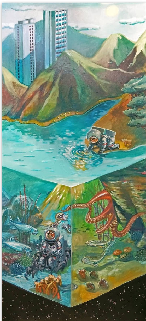
JACKIE LAM a.k.a. 009, 探索自己的深海 Explore your own deep sea, 2025, acrylic on canvas, 100 by 45 cm