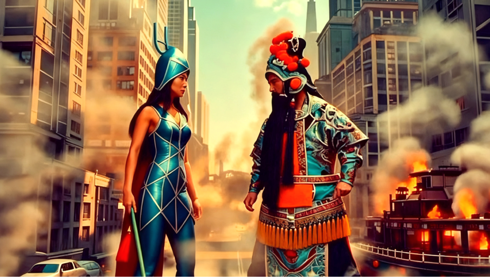
Film still from Guan Yu vs. Wilson Shieh (2025)