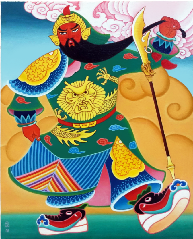
Wilson Shieh, The Cut of Guan Yu 關公斷, 2025, oil on canvas, 50 by 40 cm

Here, Shieh's signature architectural figures, cloaked in the silhouette of Hong Kong's landmark buildings, roar to life as mighty warriors wielding traditional Chinese weapons. This mesmerising experience extends beyond traditional gallery viewing—featuring a meticulously recreated vintage cinema environment and groundbreaking AI-generated film that brings these painted warriors into stunning animated battle.