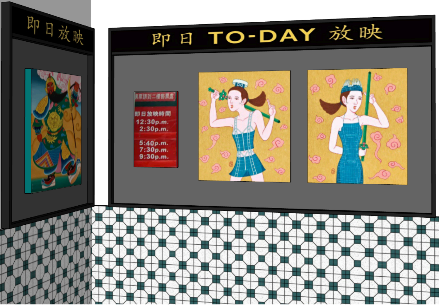
Exhibition Rendering (for reference only)