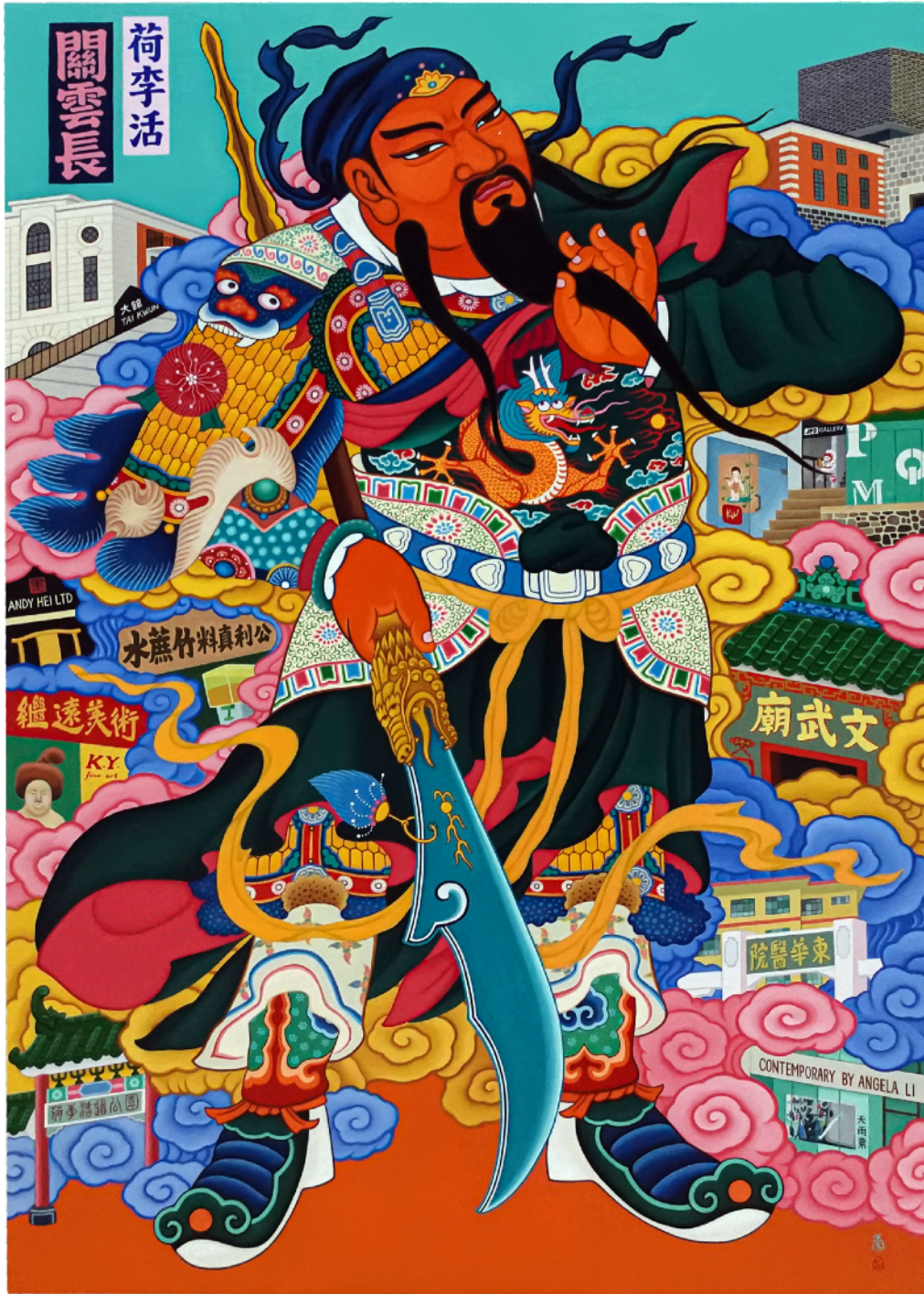
Wilson Shieh, General Guan Yu on Hollywood Road (April 2024 version) 荷李活關雲長（甲辰年二月版），2024, oil on canvas, 140 by 100 cm