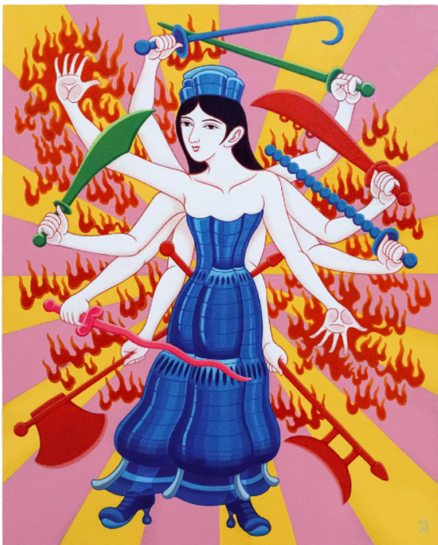
Wilson Shieh, Goddess of Plastic Blades 膠劍女神, 2025, acrylic on canvas, 75 by 60 cm