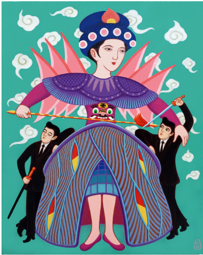
Wilson Shieh, Xiqu Centre 戲曲中心 , 2025, acrylic on canvas, 50 by 40 cm